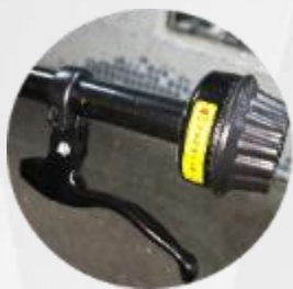
Installing brake handles