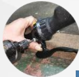
Tighting brake handle