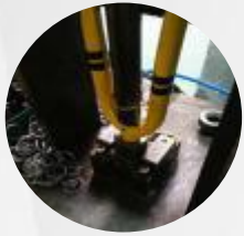
Pressing the crown races