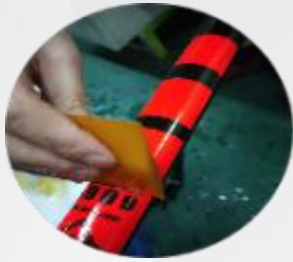
Seat tube decal