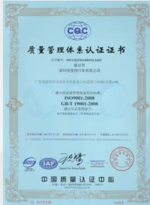
2 ISO 9001-2008 Quality Management System Certification