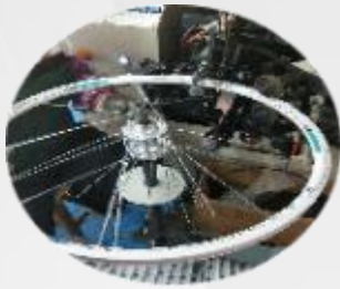
Connecting spokes with rim