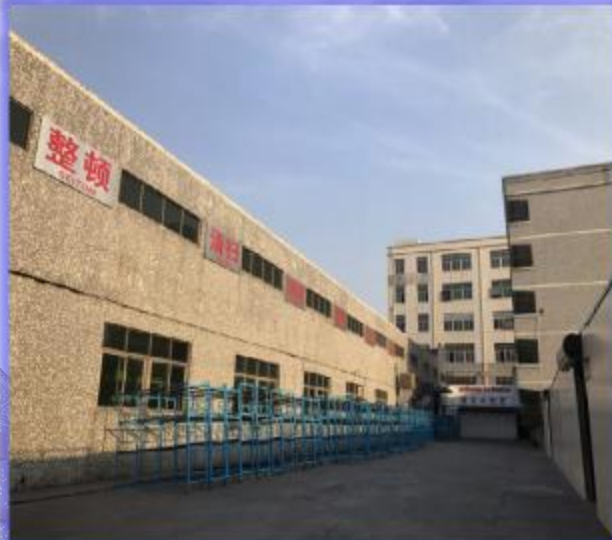
Factory inside view