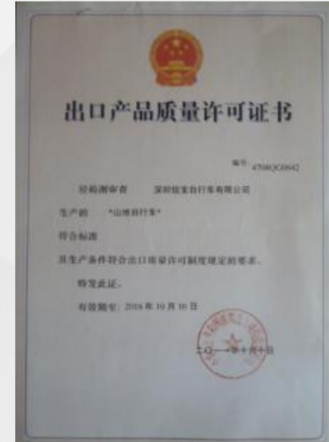
3 Quality License for Export Products