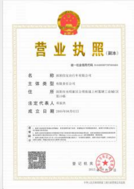
1 Business License