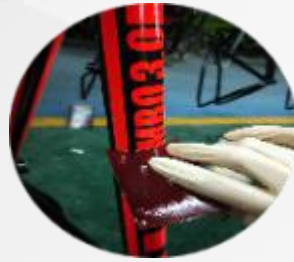
Top tube decal