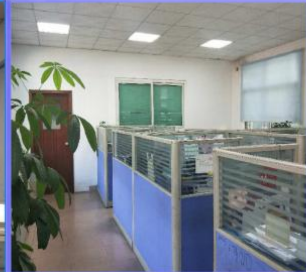
Office Inside view