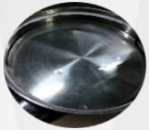
Water temperature adjusting