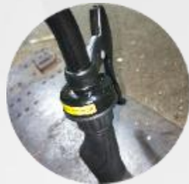
Insalling handlebar grips